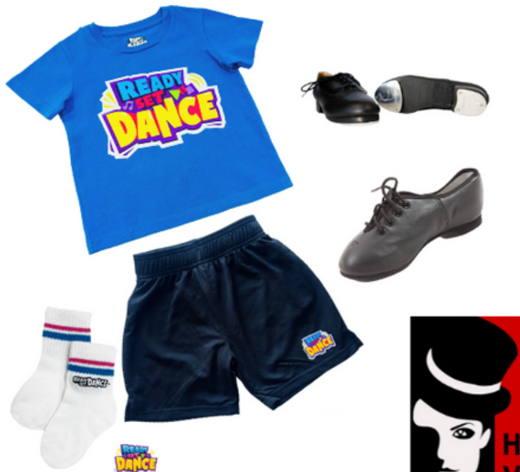
RSD Boys Mid Pack